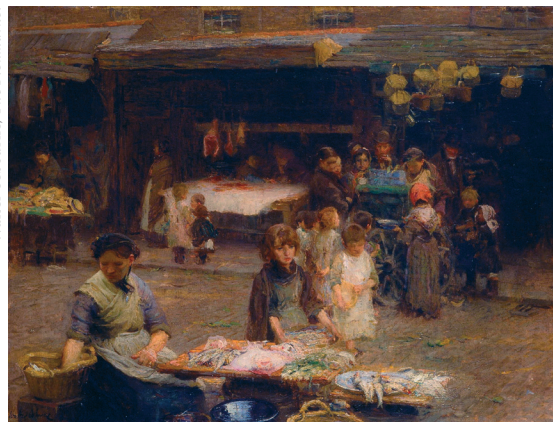
Walter Osborne, The Fishmarket